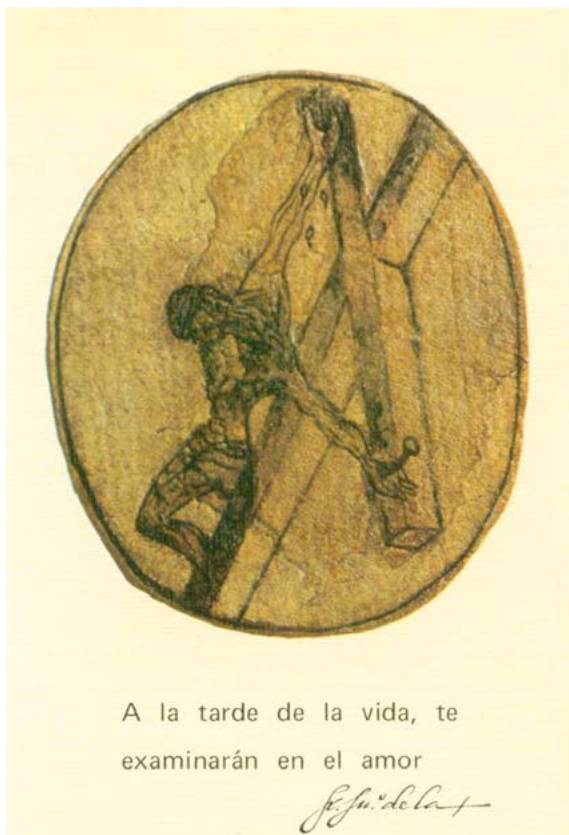
«At the sunset of life, you will be judged by your love» drawing and caption by St John of the Cross

demands the sacrifice of one's will for the service of the Congregation, what does it mean for the laity? Even if the lay person is not bound by law, he is still required to fulfil God's will; he can't be satisfied with intentions and declarations: "It is not enough to say: Lord, Lord, to enter the Kingdom of Heaven; you must do the will of my Father who is in heaven" (Mt 7, 21). Whosoever does the will of my Father who is in Heaven, he