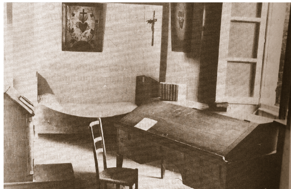
St Michael Garicoits' room

If Life brings me joy, it's all I ask for at this moment: be ever more alive and joyful so as to share with all but especially the