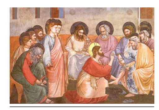
To serve means placing ourselves at the level of the brother, sometimes even lower

In line with the rich tradition of the history of consecrated life and of the Church, our Rule of Life alternates collegial government with General and Regional Chapters, the personal government of su-