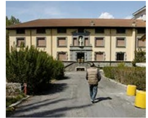
Colico, Italy – the only community of the Vice-Province created during the 1947 General Chapter

Nonetheless, the task of the General Council was arduous and demanding. It was no easy matter to divide an Institute composed of few members, of different cultures, speaking different languages and scattered over four continents. In the minutes of the General Council meeting of 25th March 1947 we read: "Returning to the question of