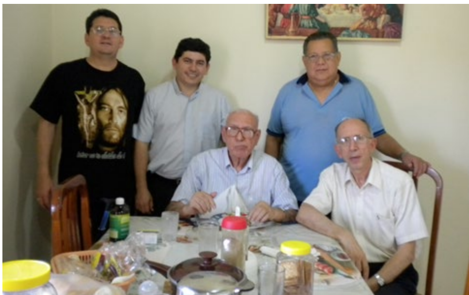
Religious Brothers & Fathers of the community at Ciudad del Este