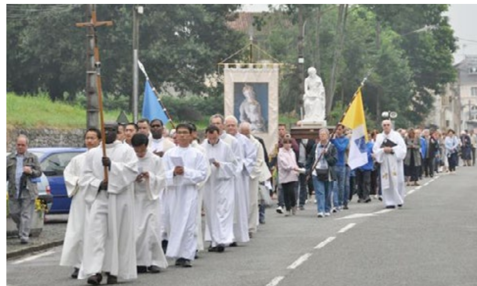
Procession with the statue of Our Lady of Betharram

That is certainly a great danger! We try to be faithful to our times of prayer together; now and again we have a day off to relax in community; we also have training sessions (this year it is on the Rule of Life); then we conclude with concelebrated Mass.