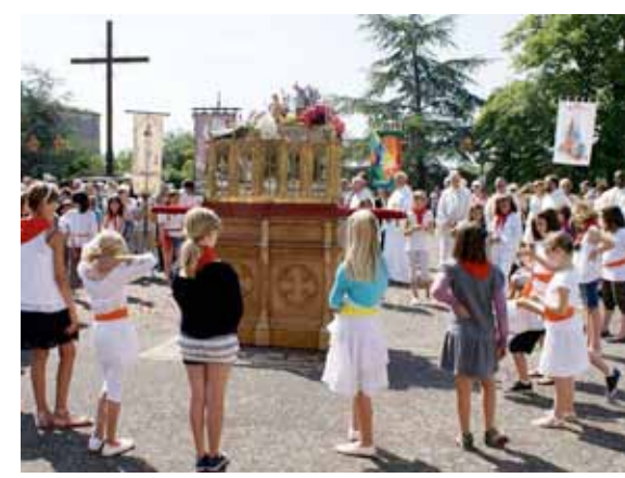
Feast of Saint Germaine in Pibrac, in 2011

The participation of the young in the life of the parish is necessary. A lot of them assemble in the different groups – Scouts de France, Scouts d'Europe etc, and their parents are also there. The Chaplaincy for Public Schools has about 50 of them; they are also there as altar servers, musicians for the liturgy; there are also two Samuel groups where they discover how God calls.