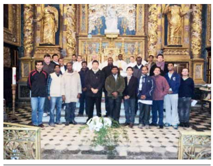
Group of the international session 2012