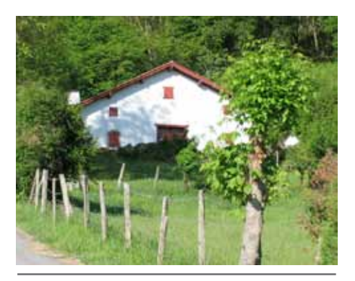
Ibarre: the humble origins of St Michael

This equality in the lacking of material goods is fundamental if our fraternity is to mean anything. Consequently those who own property must renounce it when they enter community. It is totally unacceptable to see in the same community some religious owning property while others have none, as was the case