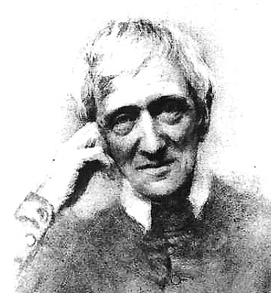
John Henry Newman, 1801-1890

On Sunday 19 th of September 2010, Pope Benedict XVI declared Venerable John Henry Newman Blessed. Pope Benedict's state visit to United Kingdom had very mixed feelings earlier. Catholics in Britain feared that the people would boycott the Pope's state visit over claims of Vatican cover up in the wake of the worldwide child abuse scandal. Around 55,000 people were gathered in Cofton Park in Birmingham where Cardinal Newman was once enjoyed the serenity natural beauty. His burial place Rednal is not very far away from Cofton Park.