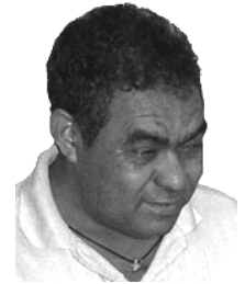
Jaboticatubas 19 April 1956