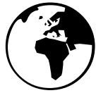
Saint Michael Region