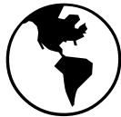
Fr. Etchécopar Region