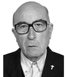
Les Aldules 31st January 1928