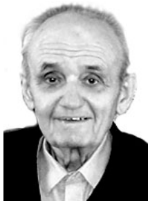
Arette 6th August 1917