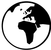
Saint Michael Region