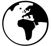
Saint Michael Region