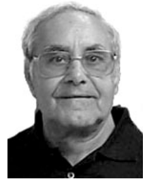
Laguna Dalga (Spain) 22 July 1945