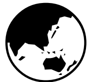
Blessed Mariam Region