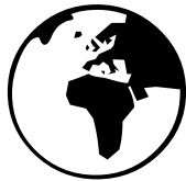
Saint Michael Region