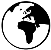
Saint Michael Region

Father Airoldi Square ■ 40 years after the consecration of the Church of the Sacred Heart, the village of Lissone took