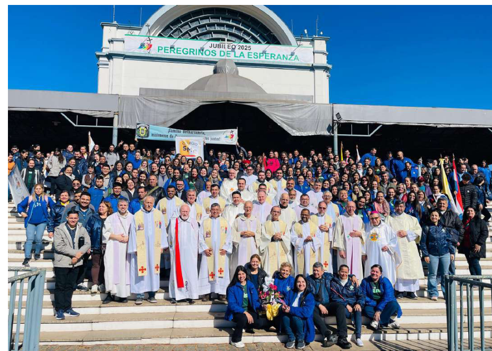
Pilgrimage of ELAB participants and lay members of the Vicariate of Paraguay to the Shrine of the Virgin of Caacupé.

tion, staying open in sincere communication and the search for communion—sharing not only ideas, but above all, personal projects—in order to build together a reality in which the “Here I am” is the true expression of Betharramite hearts, “ready to run [...] wherever they might be called, even and above all to the most difficult ministries, those that others would not want.” (DS § 6) ■