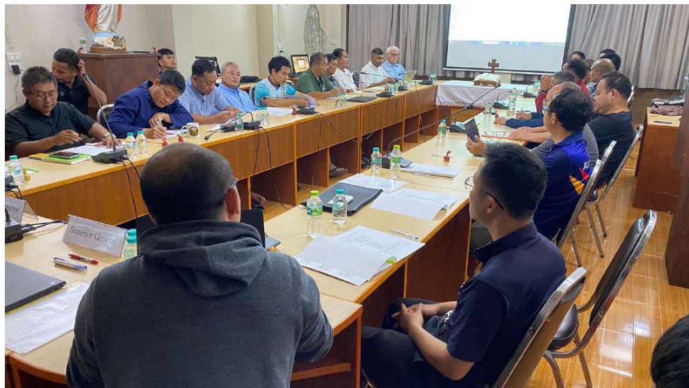
Assembly of the Vicariate of Thailand-Vietnam | 4-5 March 2025