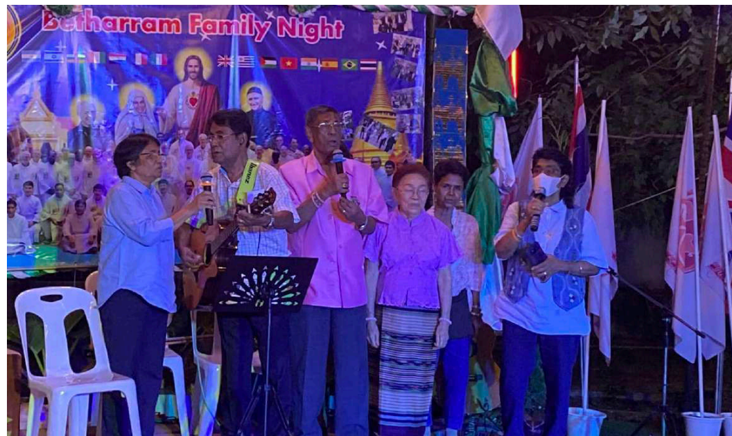
Presence and help of our alumni and benefactors during the 2023 General Chapter in Chiang Mai

I am proud to represent Betharram at Saengtham, working alongside the diocesan formators to create an environment where students can excel academically while also de-