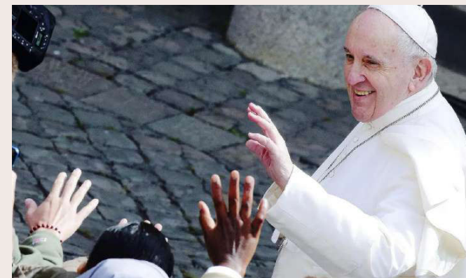
Miserando atque Eligendo

In the Name of the Most Holy Trinity. Amen.