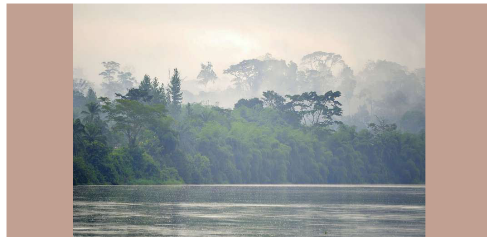
On the Ubangui river

Lord. I understood that the simple action of volunteering was no longer enough, and that to continue with perseverance in my commitment, something more solid was needed: the Word of God and an intimate relationship with Him through prayer. From the Word is born a reflection, then motivation, which is what has allowed me to grow with what it implies: the ability to move, to go out of oneself to go towards the unknown, having confidence in the One who calls and who is always close even if, sometimes, surprises are not lacking.