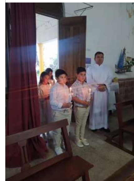
First Communion group in a rural community

Our task is to animate the pastoral activities (biblical reflexion, catechism, visiting patients and helping pastoral agents) in places where we are in charge of. In the three parishes, we take in charge about 15