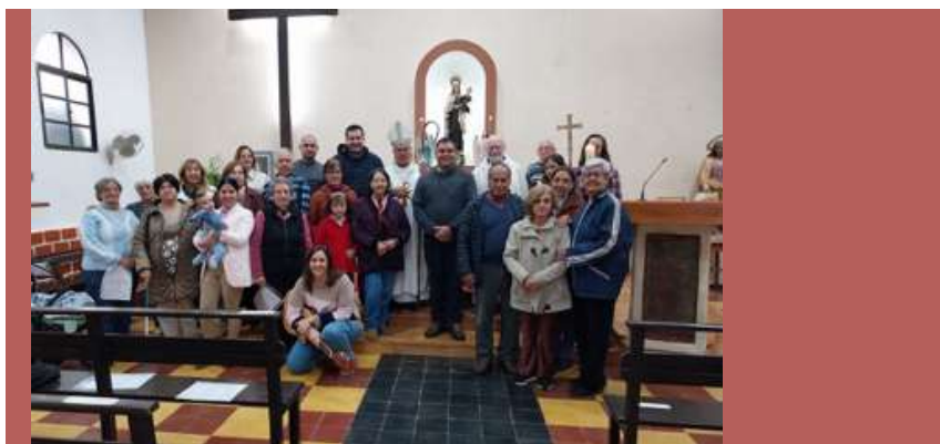
The parish community of San Gregorio de Polanco