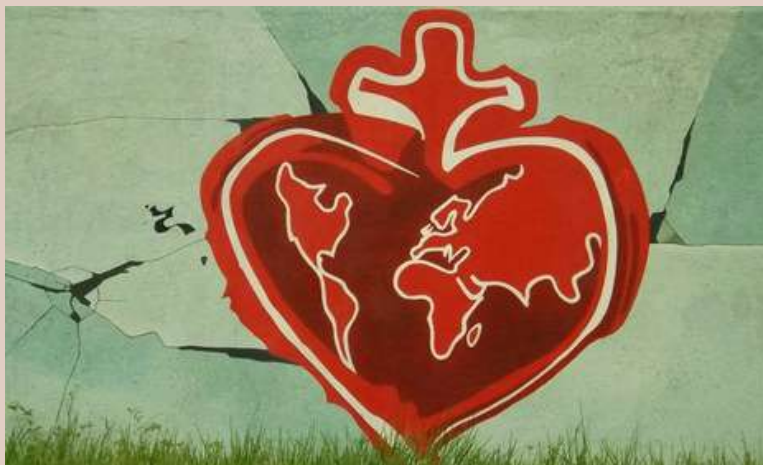
Detail of the painting on the boundary wall of our formation house of Aliqporbani