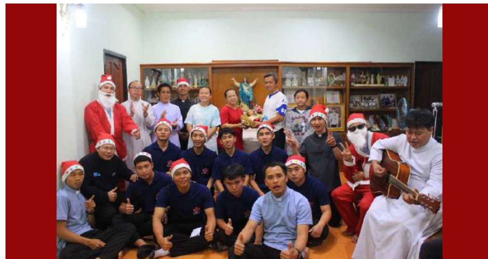
Celebrating Christmas with families, December 2019.

After more than 5 years of this experience, I would like to thank God for helping me grow with the help of the Superior General, the Regional Superior, the Regional Vicar of Thailand, and all the members of the Thai Vicariate. This experience is for me an opportunity for my ongoing formation in order to better serve the Congregation. "Always forward" (St. Michael Garicoits). I am always ready to do my best in my pastoral activity according to the spirit of our Congregation, readily and unreservedly, without betraying the word given, and all out of love. ■