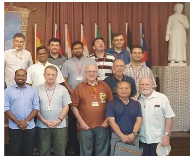
On the picture: the 34 members of the General Chapter (ex officio members, elected members and one guest member).