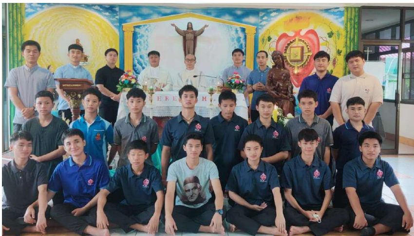
Young people in formation in Sampran Ban Garicoits

So, our missionaries proclaimed the Good News and sowed the seed of faith which took root in the hearts of the people in the culture of the tribal communities in the northern part of Thailand.