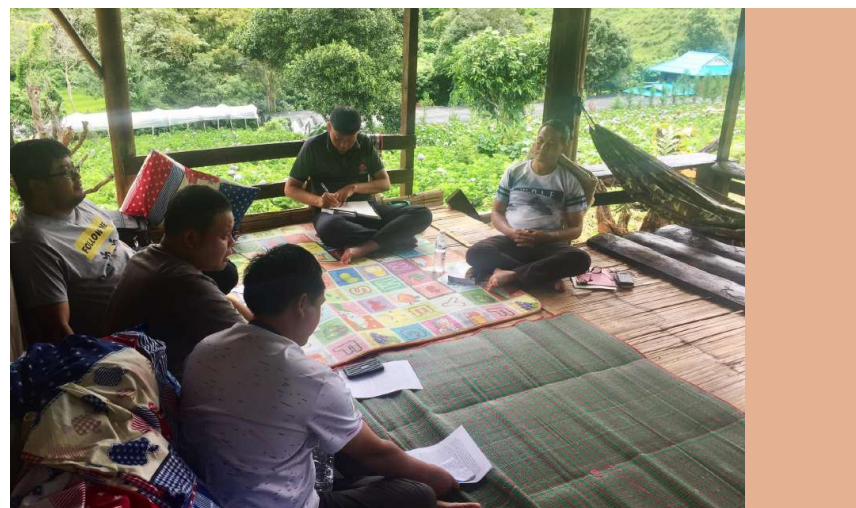
The retreat, an opportunity for all our members to renew and deepen the meaning of our religious life as members of the Betharramite family.