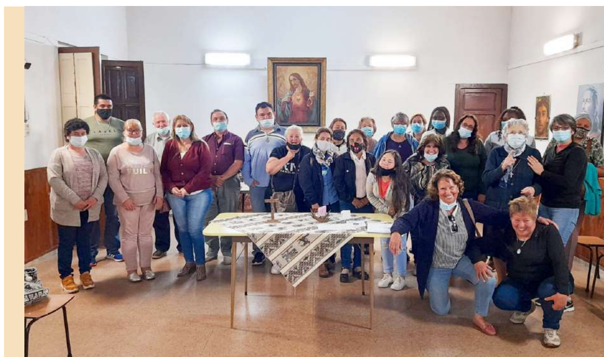
Parish Council at Paso de los Toros

Perhaps the hardest thing was to abandon the "asymmetrical comparisons", which lead us to think that the best thing is "my language", "my culture", "my roots", "my ecclesiology", "my way of knowing God and others." This "crossing" was not easy to achieve and we had to change the "software". Now, with