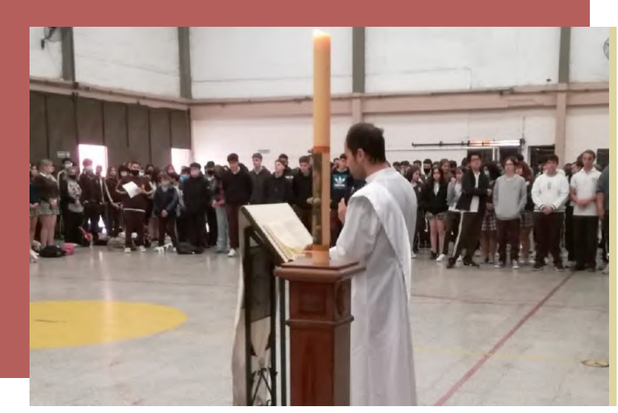
During the celebration of the Word in my former highschool

And secondly, I think that pushes us to stop taking refuge in a den but to go out, to go to new horizons, following the example of Jesus who left Nazareth so that others could