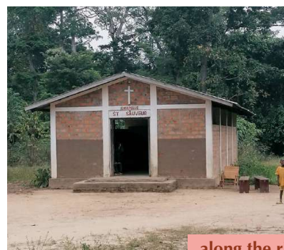
along the river Oubangui

to the lay associates and to the friends of Betharram!