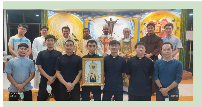
Community of Sampran on August 25th, Feast of Saint Mary of Jesus Crucified