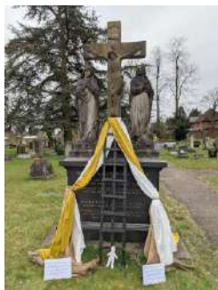
the daughters of Jerusalem

St. Margaret's church was particularly keen to animate a station based on Joseph of Arimathea. Why? There is a medieval English legend that Joseph of Arimathea once came to England on a trading journey bringing with him the boy Jesus.