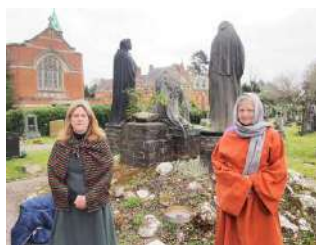
the women who followed from a distance