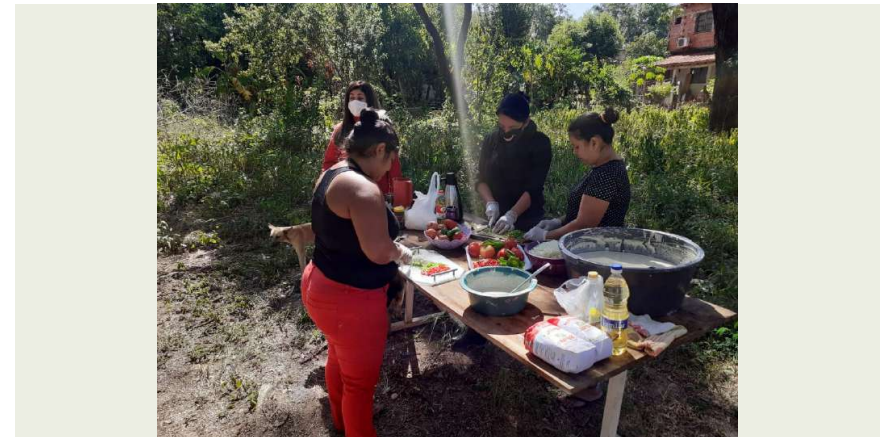
A stronger community is a community of solidarity

faithful all lived together, and owned everything in common” (Acts 2:44). This is the secret. The terrible persecution failed to disperse the disciples of Jesus. On the contrary, it favoured the strengthening of communities, organized and united by love and solidarity. What is defined today as a pandemic gives us the opportunity to testify to our faith, not only in virtual celebrations, but much more and better still in gestures of solidarity. Faith begets hope and translates into Love. This global crisis may give birth to a new humanity: changes will not happen so quickly, but it is certainly a moment that God offers us to testify that He lives, that He is eternal and that we are mere mortals, destined to be reborn to Eternal Life. We see the light, not at the end of the tunnel, but very close to us. This