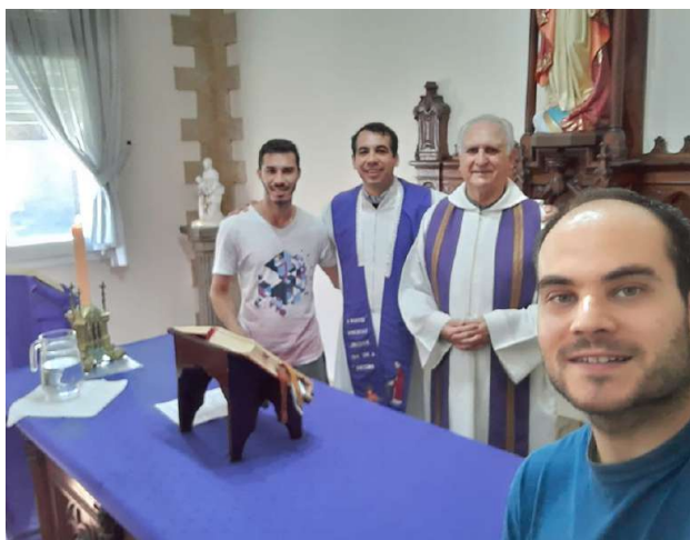
SCJ Community of Adrogué (Argentina)