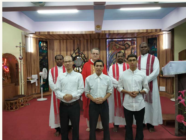
Welcome to three new postulants from Vietnam! Betharramite Formation House in Bangalore, India.