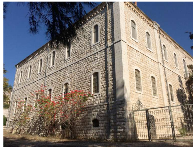
SCJ Nazareth House

Among the 1975 General Chapter proposals was the project of creating a home for the scolastics in Bethlehem, which did not take shape. However, during the third Congregation Council, it was decided to organize two months of recycling, in 1978, for a score of Religious aged between 45