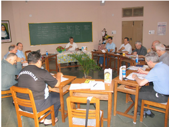
Council of the Congregation in Bangalore 2007

Yet there were not many other possibilities for organisation. The two years ad experimentum (2009-2011) allowed us to figure out the difficulties and adjust certain points. The General Chapter of 2011 finally approved once and for all the new version of the Rules.