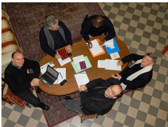
A Regional Council: to look further ...or higher