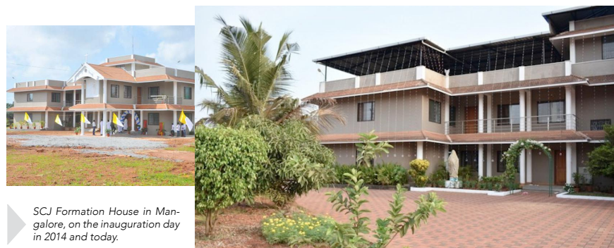
SCJ Formation House in Mangalore, on the inauguration day in 2014 and today.

The new house of formation, inaugurated on 10 September 2014, was dressed up for the feast. After the mass, the youths linked to our community offered biblical performances, dances and pantomime to all the guests: in the first row were the Sisters of the Apostolic Carmel who, in 1999, made available to the religious of Betharram the house of Maria Kripa. Also many lay people, parishioners and diocesan priests, were invited to