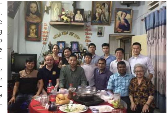
The whole SCJ "community" in Vietnam - among which the three young people making vocational discernment - as guests for dinner by a family of well-wishers.

To be a good religious in the future is important to learn to accept our own mistakes and the mistakes of others; accept that we are differ-