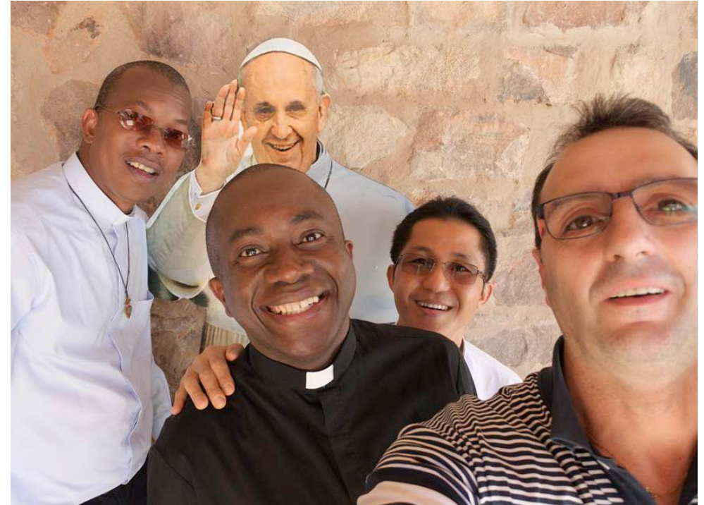
San Bernardino, May 2017 Young sons* of Saint Michael at the General Chapter together with a Jesuit,... never mind... same family!