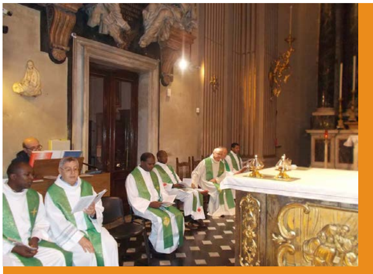
Mass at Santa Maria dei Miracoli church (Rome)

her, the word incarnate who is made close to everyone. They were the source of our meeting with her, of her meeting with Him, through communion, which was the most important thing. We reached the goal of every missionary: to announce Jesus as the person who loves this old lady and becomes close to her. This lady was filled with joy, and so were we, as we had managed to bring her the happiness that Jesus brings.