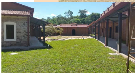
Betharram Retreat House at San Bernardino