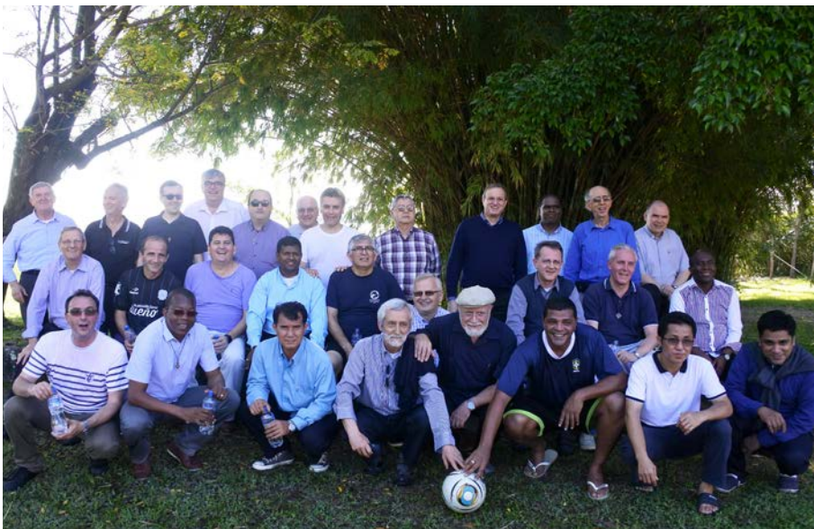
The Chapter members 'Real Madrid' style