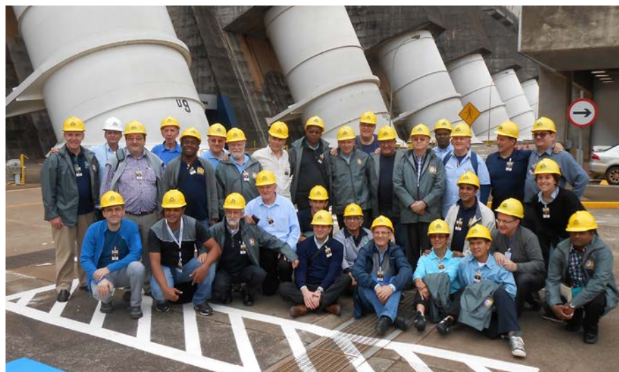
Chapter members again in Playmobil style at the Itaipu dam. But no panic... the wearing of hard hats will not be among the General Chapter resolutions!

I entrust to Our Lady of Betharram our new Superior General and his Council, that the Lord may accompany them in their service so that Betharram continues to go without delay running to embrace life's call.