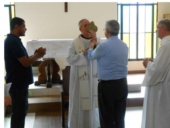
Thanksgiving mass in the chapel after the election of the new Superior General, San Bernardino, 18 May 2017

up on what had been decided: the Regional Superior departed (after a visit) and the contrary was done to what had been decided during the visit! Elsewhere, there was a lack of communication between the Regional Superior and a Vicar. Sometimes, the Vicar took important steps without consulting the Regional Superior. Most of these difficulties are overcome when the spheres of authority of each one are respected, and if one works by applying the law of subsidiarity in a spirit of faith and service. Regionalisation was a positive development as it overcame the isolation of the Vicariates and established greater unity in the Congregation, while respecting cultural diversity. Greater knowledge of the Rule of Life by all, the Superiors, the Vicars and the religious, will foster dialogue and allow us to re-read our lives and ways of helping each other retrieve our identity as consecrated