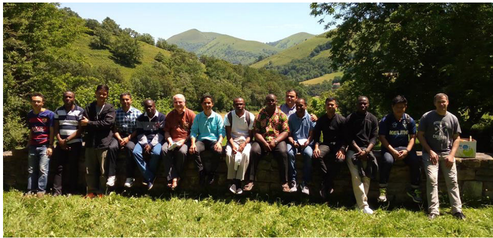
Members of the 2016 session

The session allows foremost to establish relationships between religious cultures: European, African, Latin American, Indian,