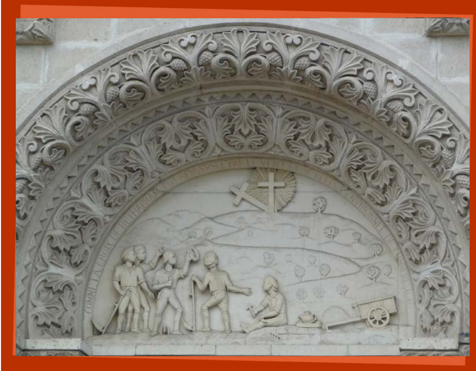
The miracle of the Cross, at the first station of the Way of the Cross at Betharram