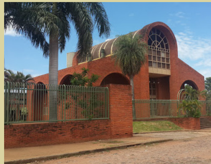
SCJ Retreat Centre in Lambaré

After this pre-Chapter, the Regional Chapter gathered from October 17 to 19.