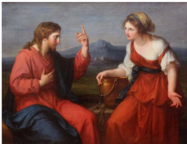
Jesus and the Samaritan woman at Jacob's well, by Angelika Kauffmann (München, Neue Pinakothek)

Saint Michael Garicoits also lived this tenderness as a feature of his mission: "What do we preach about our Lord? Tenderness at all times: in his incarnation, his holy childhood, his passion, his Sacred Heart, in his outward life and inward grace, in his words and in his eyes ... So what should be the main characteristic of our spiritual life? Christian tenderness! Without it, we cannot possess the spirit of generosity to serve God. It is necessary for both our inner life, in our relationship with God as well as in our outer life and our relationships to men." (MS 200).