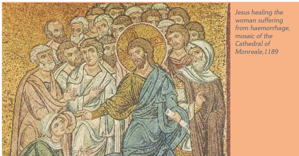
Jesus healing the woman suffering from haemorrhage, mosaic of the Cathedral of Monreale, 1189

charism in the Rule of Life. The charism of the Congregation of the Sacred Heart of Jesus: