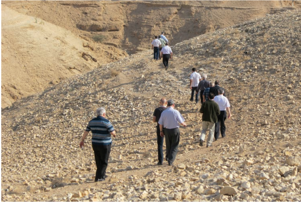
Interior pilgrimage towards Jesus

to serve. Here are some quotes from the Pope Francis: Spirit-filled evangelization is not the same as a set of tasks dutifully carried out despite one's own personal inclinations and wishes (EG. 261).