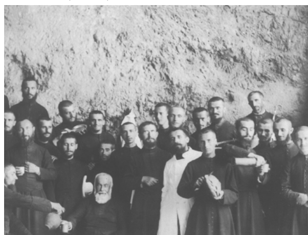
Scolasticate in 1898 Walk to an archeological site and... picnic!

At the end of the 19th century the residence of Bethlehem had become the spearhead and centre of the whole Congregation. To avoid the seminarians (or scholastics as they were called then) having to do the two years National Service required by French law, in 1890 the chaplains' residence accepted part of the young recruits for the Congregation; these young candidates were leaving France knowing that for at least ten years they would not be able to return —