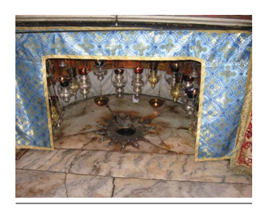
Bethlehem: Verbum caro, hic factum est.

missionary spirit and the stability to pursue an apostolic project. The youngest and most active of the religious had their initial formation at diocesan level. The not so young have a diocesan mentality rather than a religious one. Not many of them know what it means to belong to Betharram, hence the need to pay particular attention to on-going formation in community so as to rediscover together the beauty of our charisma when lived in another cultural and religious context. Enculturation of the young religious is most important. Consequently it is absolutely necessary to begin by learning a local language as a tool for communication and insertion. Something else which is of vital importance is integration in the Arab and Jewish culture with courage, passion and love. Anything gleaned in books is useless. The Mother Church in Jerusalem is rooted in the Middle East, meeting point of peoples, religions, tongues, cultures and thousand year old histories. It is a world to be discovered, known, interpreted and with which to communicate. If this is missing, the religious is living under a cloud, cut off from the surrounding world, and with the risk of