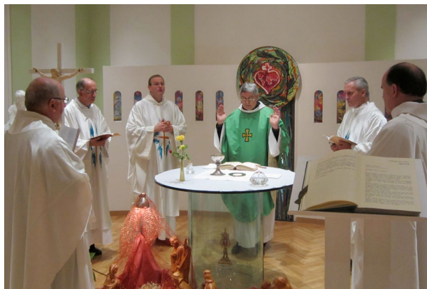
For the government of the Congregation, the Superior General is assisted by a General Council and the Council of the Congregation. (R of L art. 200)